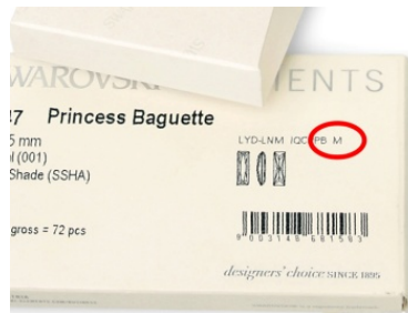
“M” mark (current packaging)