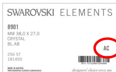
“AC” mark (current label for Lighting articles)