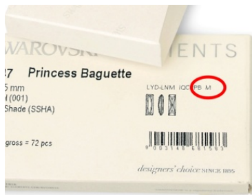
“M” mark (current packaging)